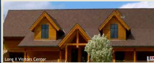
Long X Visitors Center