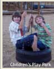
Children's Play Park