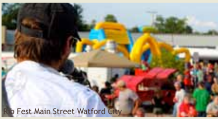
Rip Fest Main Street Watford City