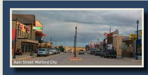
Main Street Watford City

To organize, promote and operate activities for the industrial and economic development of Watford City and the local vicinity. To benefit and promote all peoples of Watford City and McKenzie County by cooperation and promotion of educational and scientific endeavors to preserve the county, city, its culture, economic well being and stimulate and encourage tourism, economic and industrial growth.