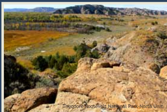
Theodore Roosevelt National Park-North Unit