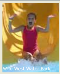
Wild West Water Park